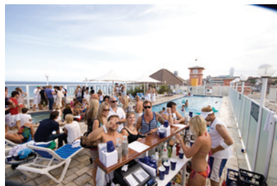
Patrons enjoy the sun at the Absolut day club

Situated on the Swiss Grand Hotel's multi-level pool deck, the venue features European-style day-club styling complete with sun lounges, maxi-umbrellas, plush towels and a series of cocktail bars.